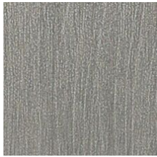
Mercury 64530 LRV 25.5