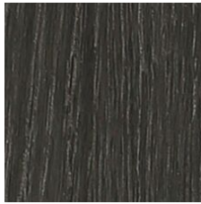
Char 64549 LRV 7.1