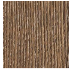
Bark 64720 LRV 12.5