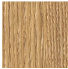
Honey 64240 LRV 26