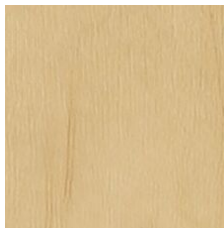
Bare 64200 LRV 39.1