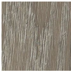
Ashen 64155 LRV 27