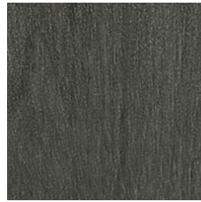
Cinder 64557 LRV 16.6