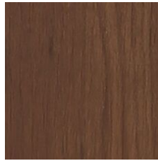
Earthen 64710 LRV 10