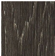
Russet 64760 LRV 7.4