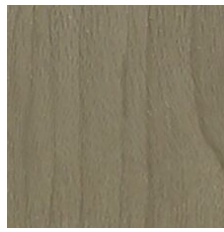
Fog 64327 LRV 17.8