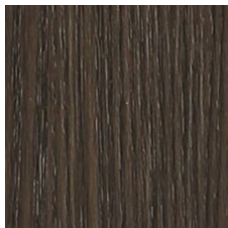
Chickory 64752 LRV 6.9