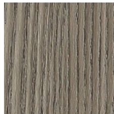
Antler 64761 LRV 18.4