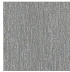
Alloy 64515 LRV 37.4